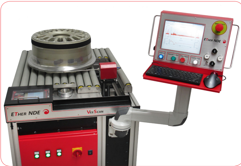
VeeScan Pivot Arm Option.

At ETHER NDE we understand that the key criteria for any Aircraft Wheel Inspection System is the need to guarantee detection of defects, the requirement to operate reliably twenty-four hours per day, 365 days per year. The demand for a simple and user-friendly interface and the business need to maximize speed of inspection and output is key. Balancing these objectives can be difficult, but we believe the VEESCAN measures up to the task.