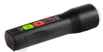
Pencil Probe - 90° Transverse