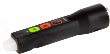
Pencil Probe - Straight