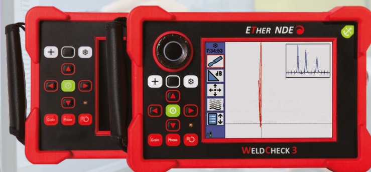
WELDCHECK SERIES EDDY CURRENT FLAW DETECTORS

At ETHER NDE we pride ourselves on offering our customers the very best in product design, manufacture and customer care.