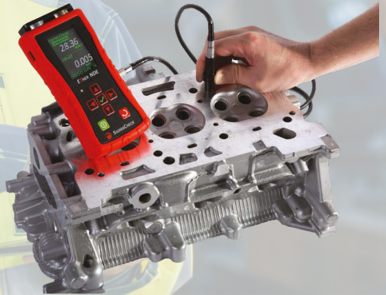
SIGMACHECK CONDUCTIVITY METER

At ETHER NDE we pride ourselves on offering our customers the very best in product design, manufacture and customer care.