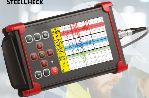
COMPACT 3 CHANNEL FLUX LEAKAGE TUBE TESTING INSTRUMENT