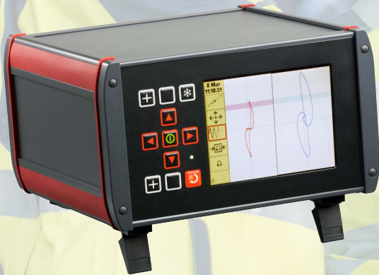
VICTOR 2.2D EDDY CURRENT FLAW DETECTOR